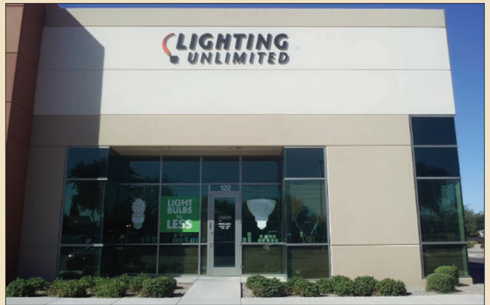
Lighting Unlimited will be moving to its new Scottsdale location in December.